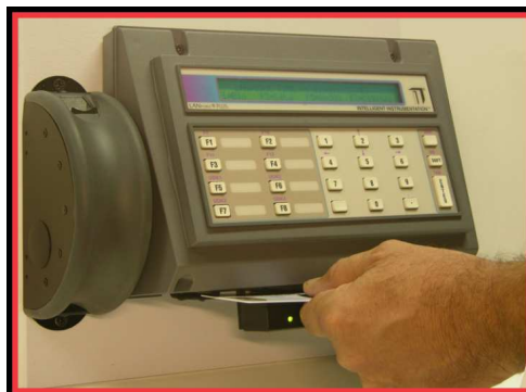
Time & Attendance Terminal – with or without fingerprint reader