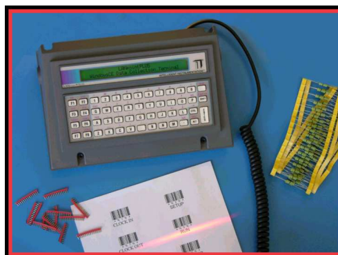
Shop Floor Terminal

Intelligent Instrumentation also designs and manufactures data collection and HMI data entry terminals, a few of which are shown here. Supported in more than 30 countries, Intelligent Instrumentation maintains a worldwide network of Regional Marketing Centers, authorized System Integrators and Value Added Resellers. To contact the local office nearest you visit our Web site at www.instrument.com .